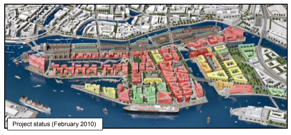
Buildings in red are completed/ under construction; orange indicates in concrete preparation/ architectural competition; yellow indicates in early preparation; green indicates very early preparation phase.

The central aims of this large-scale urban development are to create a 'compact' city of short journeys with residential areas that are compatible with the neighbouring port activity. As a "brownfield development", HafenCity reuses former port and industrial land. As of October 2009, 875 residential units had been completed in the west of HafenCity, with approximately 1,500 residents in the new neighbourhood and more than 5,500 people working here.